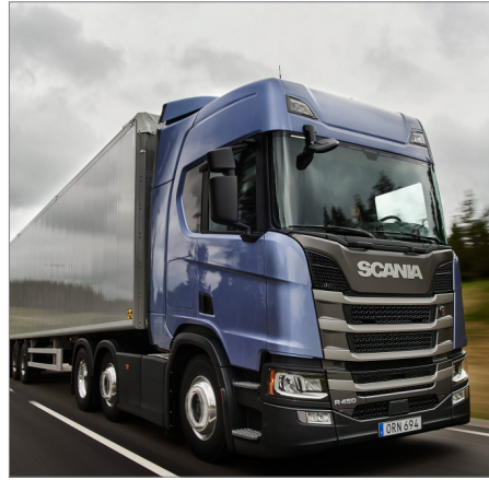
The new Scania R450 Truck