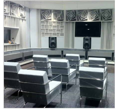
Scania's Listening Studio for subjective evaluations

Per-Olof has also been working with the aerodynamics department to compute the wind noise at the driver's position based on CFD calculation results that his colleagues provided him. "The CFD results are mapped on the outer surface of the cabin and then, the results are computed inside the cabin using a Modal Frequency Response," Per-Olof added.