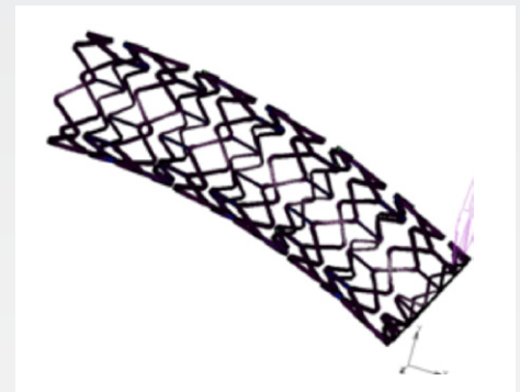
Bending of a stent