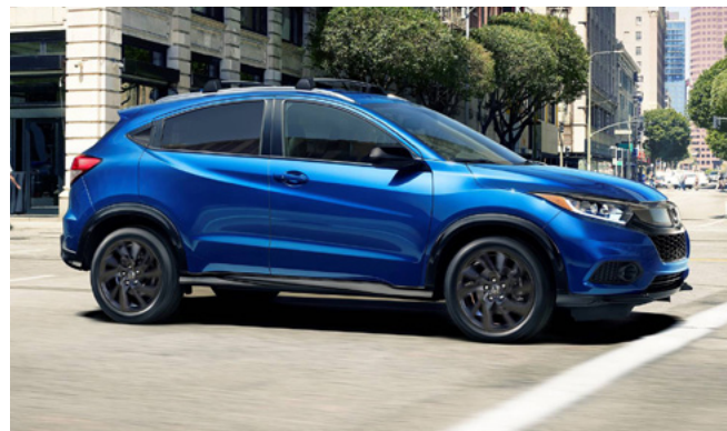
Above: The Honda HRV, which undergoes many multibody dynamics simulations, due to its off-road capabilities.