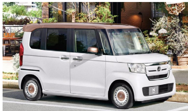
Above: The Honda N-Box, the top-selling Honda in Japan in 2021.