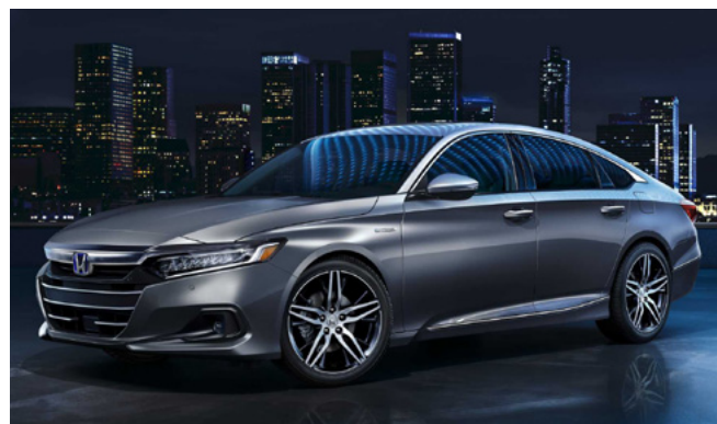
Above: The Honda Accord, which undergoes structural analysis and road vibration damping to maximize driver comfort.